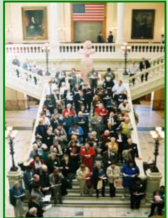
Presbyterians sing on the steps of the Georgia State Capitol on Presbyterian Rally Day