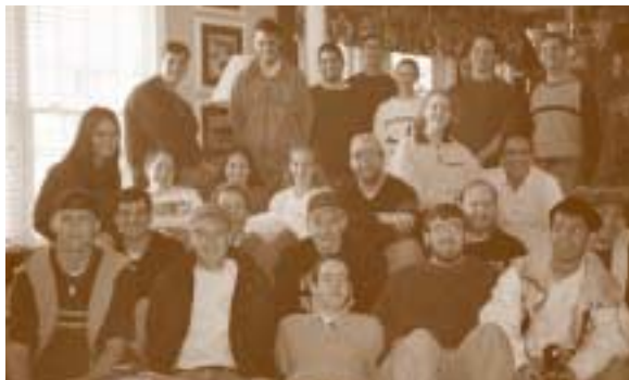
Campus Ministry students at a ski retreat this past year

These words came from a letter written by a sophomore to incoming students. He was excited to invite them to one of the campus ministry programs sponsored by the Presbytery of Greater Atlanta. He goes on to say, "Not only is WCF a great place to grow in your faith, but also is a place to hang with friends, get help with homework, and just plain have fun."